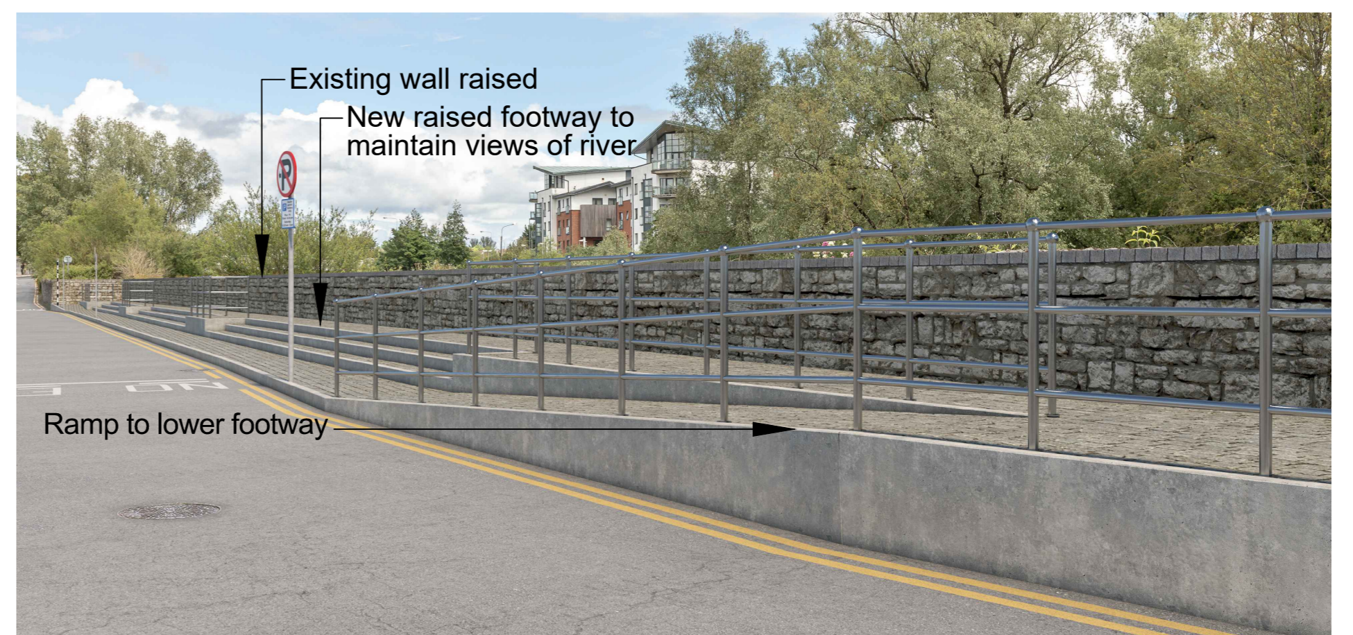
Artists impression of proposed stepped footway to maintain views over the raised wall (KIFRS-A-009)