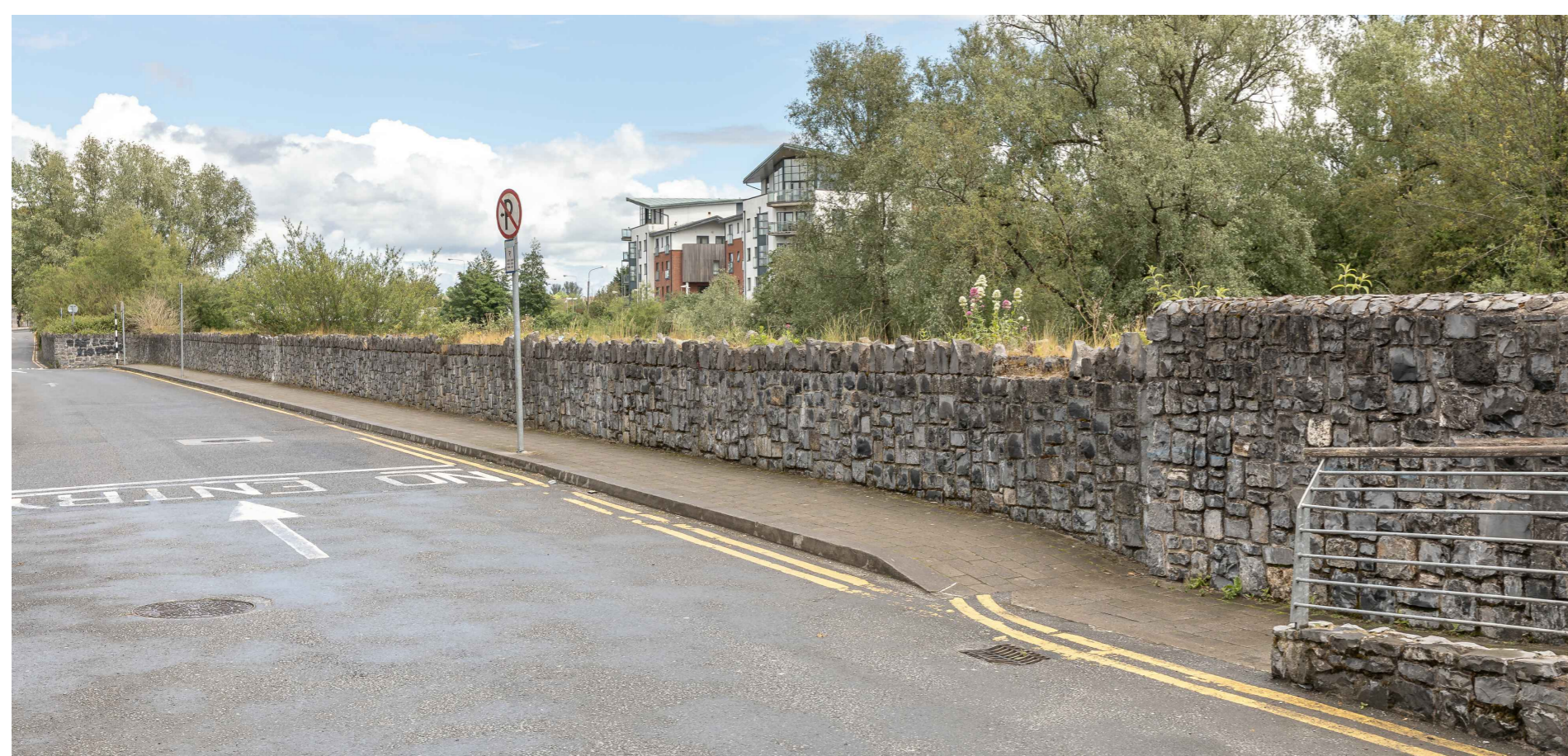
Existing situation along Sir Harry's Mall (KIFRS-A-009)