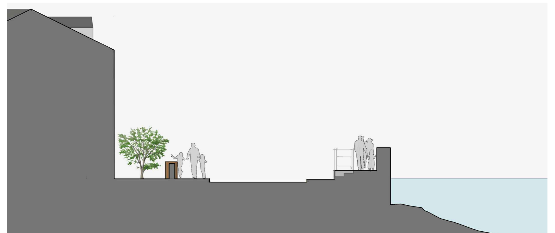
Illustrative section through Sir Harry's Mall and the proposed stepped footway (KIFRS-A-009)